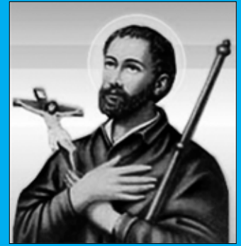
St. Francis Xavier, Patron of Ranchi Archdiocese

Monthly News Letter of Ranchi Archdiocese