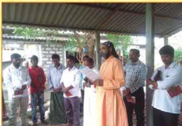
Mission Visit, Khammam