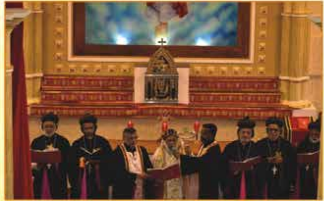
Church Blessing, Singasandra