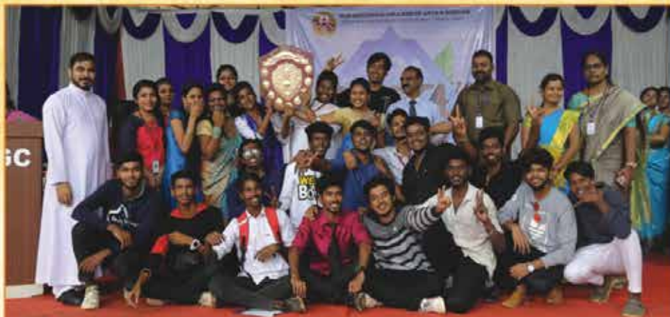
Cultural Fiesta, MGC Chennai