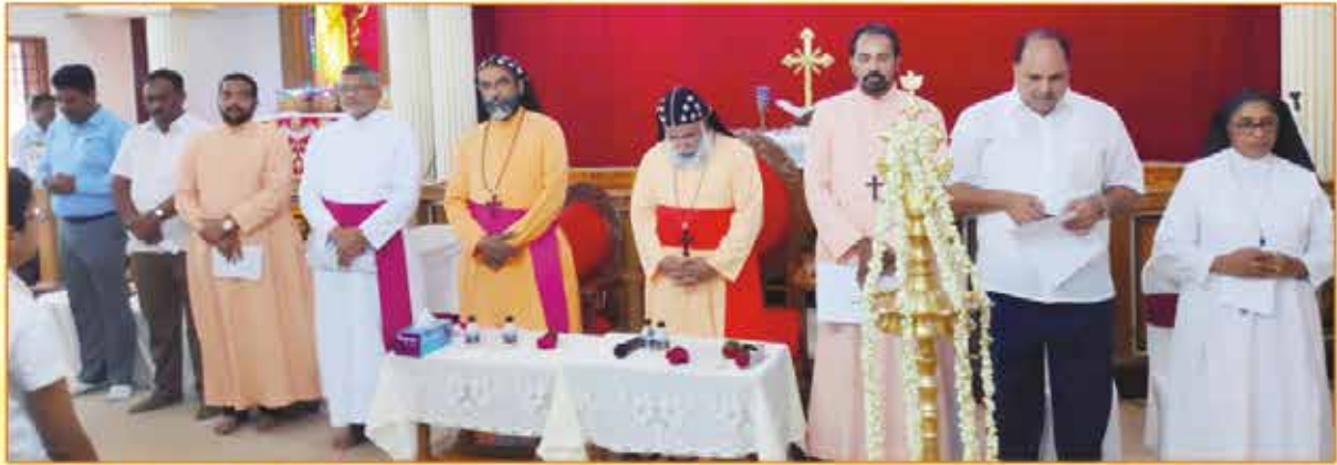
Concluding Ceremony of Parish Silver Jubilee, Kharghar