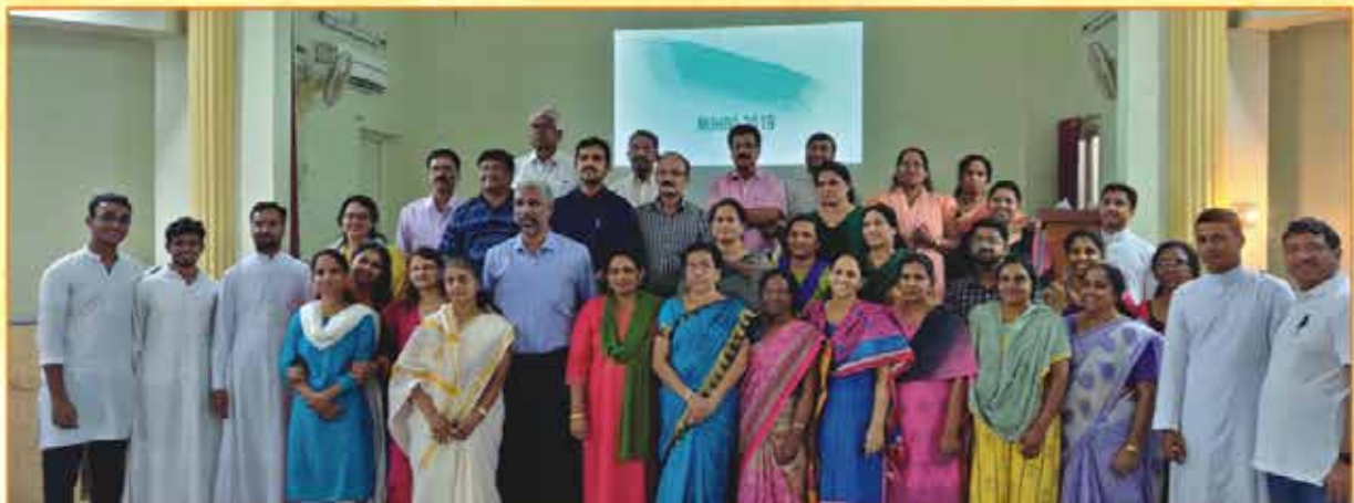
MCA Inter-Parish Quiz Competition, Pune