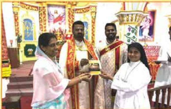
MCCL Booklet Inauguration, Dehuroad