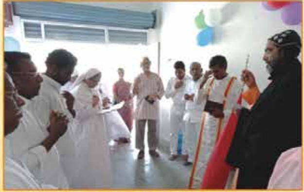
Inauguration of Computer and Spoken English Centers, Kaikaluru Mission