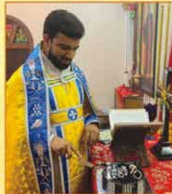
Vicar's Feast Celebration, Vikhroli