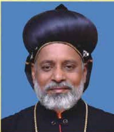
Yoohanon Mar Theodosius (11 Jan)