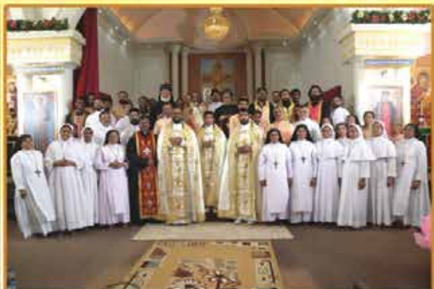
Priestly Ordination, Khadki Cathedral