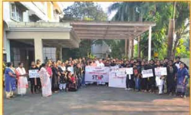
Silent Rally, MCYM Vasai