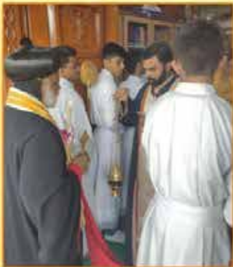
Parish Feast, Borivali