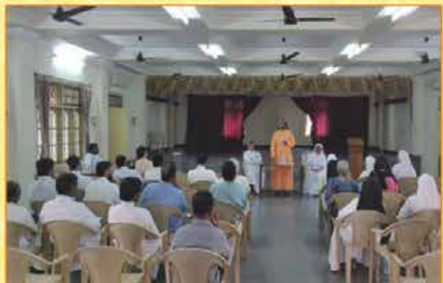
Diocesan Mission Meet, Hyderabad