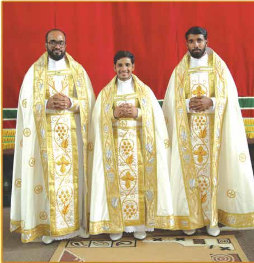
Congratulations Dear Fathers...Hearty Welcome to the Priestly Koinonia of the Eparchy of St Ephrem.