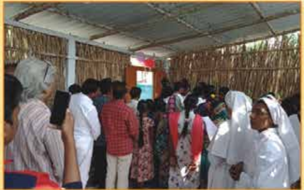
Blessing of Prayer Hall at Kalvakot, Kaikkalur Mission