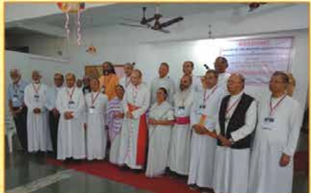
Western Region Bishops' Council and Western Region Catholic Council, Mumbai