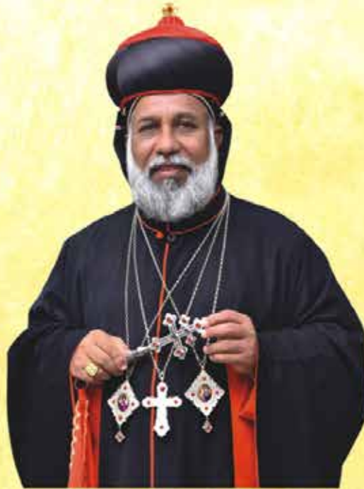
His Beatitude Moran Mor Baselios Cardinal Cleemis Catholicos (1 Jan)