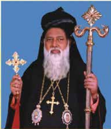
Moran Mor Cyril Baselios Catholicos (18 Jan)