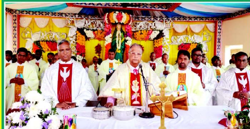
Feast of Our Lady of Lourdu's Mariapuram.